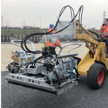
HVZ-UNI-II-EK with HVZ-UNI-II-PK-II